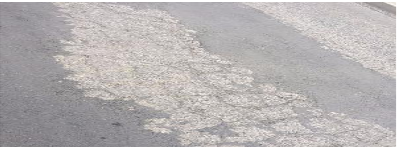
Fig.8: Flexible pavement Patching sample

There are small pieces of asphalt pavement in the surface which is more than 0.1 square meters and they are replaced or their materials increased in a portion in the construction of pavement called patch deterioration as demonstrated in Figure 8. Several issues cause patching for instance when the original distress spreads, poor connection would be between the patch and existing pavement, wrong compaction while patching, wrong material mixing, and rut settlement appealing at the perimeter or inside the interior side of the patch (Thant & War, 2019).