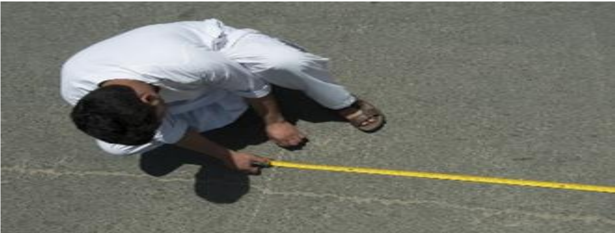
Fig. 3: Transverse crack in flexible Pavement (Hafizyar & Mosaberpanah, 2018).

Block cracking happens unlike other cracks specifically alligator cracks, they are a collection of interconnected rectangular peaces which could be all throughout the width of the pavement not just in the wheels paths as demonstrated in Figure 4. If the severity is low in these cracks, it is possible to repair and fix it with a “thin wearing course”. But high severity may need overlay and recycling. The causes are proved to be aging, oxidative hardening of the Asphalt Concrete (AC), wrong binder mixture, high void content, shrinkage and temperature cycling (Osmari et al., 2019).