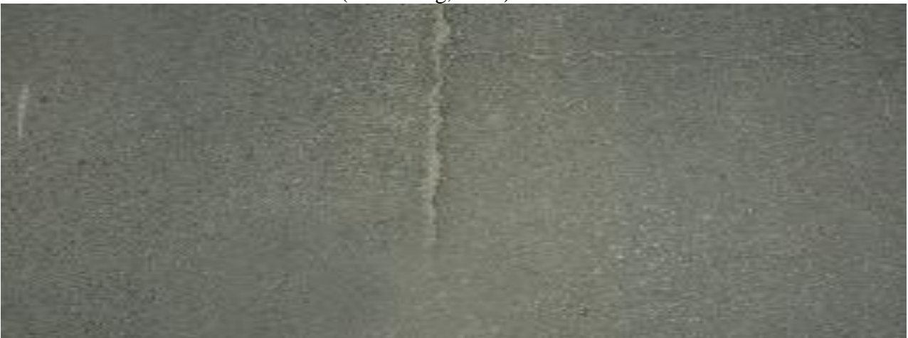
Fig. 2: Longitudinal crack in flexible Pavement

There are some fractions that are mostly appearing in the centerlines of the pavements which is called longitudinal cracks (Lan & Chang, 2019). As shown in Figure 2. Climate affects the shrinkage of the asphalt layer and it helps these cracks to grow. At the same time joining two sections of the pavement with a poor construction is another cause and temperature cycling or unfair operations on the paver could be the reasons for these cracks (Li & Yang, 2019).