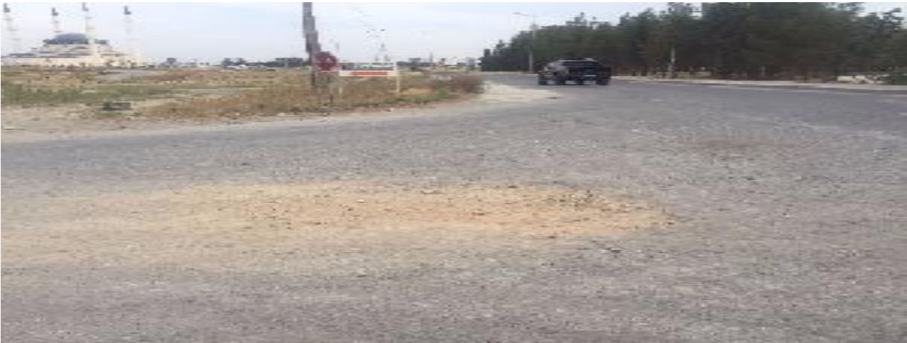
Fig.7: Pothole in flexible Pavement