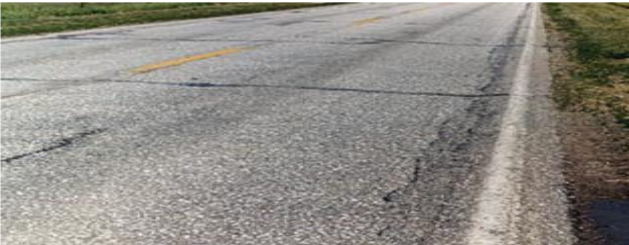
Fig.6: Rutting crack in flexible Pavement

Depression of the longitudinal surface in wheel path is rutting which deteriorate the asphalt and cause other cracks. It is actually a surface failure which holds water in the wheel path (Vaitkus, 2014). A wide narrow crack shows a subgrade failure as demonstrated in Figure 6. It is possible to say that causes are low air voids, too much dust, rounded aggregate, high asphalt content, and too much natural sand (Zhang et al., 2019).