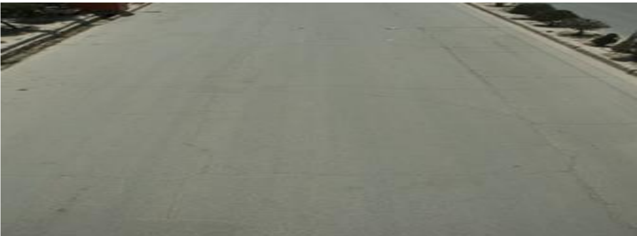
Fig. 4: Block crack in flexible Pavement

Block cracking happens unlike other cracks specifically alligator cracks, they are a collection of interconnected rectangular peaces which could be all throughout the width of the pavement not just in the wheels paths as demonstrated in Figure 4. If the severity is low in these cracks, it is possible to repair and fix it with a “thin wearing course”. But high severity may need overlay and recycling. The causes are proved to be aging, oxidative hardening of the Asphalt Concrete (AC), wrong binder mixture, high void content, shrinkage and temperature cycling (Osmari et al., 2019).