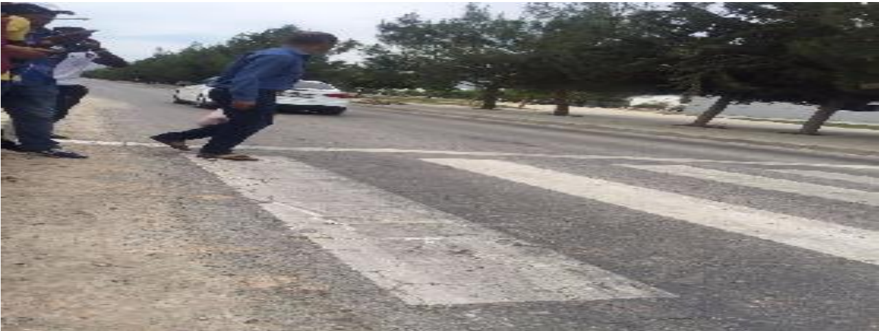
Fig. 5: Edge crack in flexible Pavement