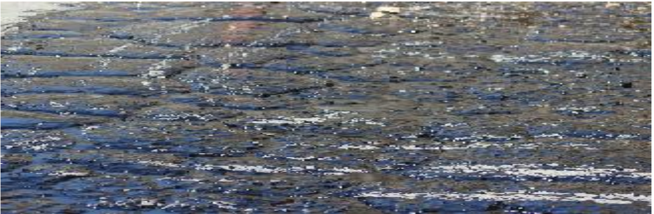
Fig. 1: Alligator crack in flexible Pavement